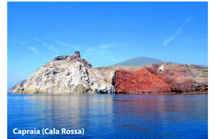
Capraia (Cala Rossa)

Calmly move towards Marina di Scarlino, but you have still time for the last swim in Cerboli, a charming island in the centre of the gulf of Follonica. The suggestive landscapes of the islands of the Tuscan Archipelago and its crystal blue sea will remain surely in the memory of this sailing holiday.