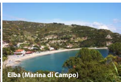
Elba (Marina di Campo)