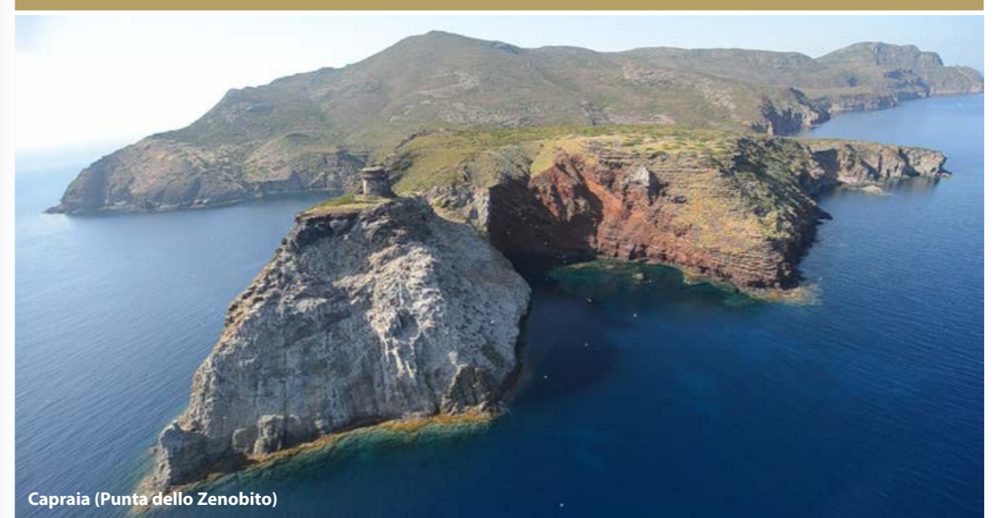
Capraia (Punta dello Zenobito)