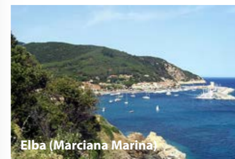
Elba (Marciana Marina)