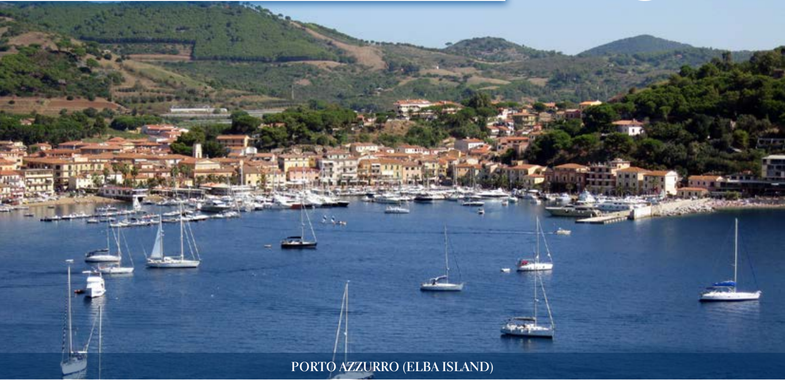
PORTO AZZURRO (ELBA ISLAND)