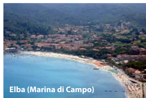
Elba (Marina di Campo)