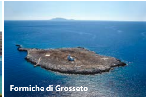
Formiche di Grosseto