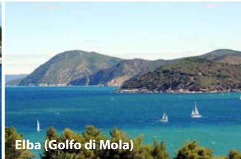
Elba (Golfo di Mola)