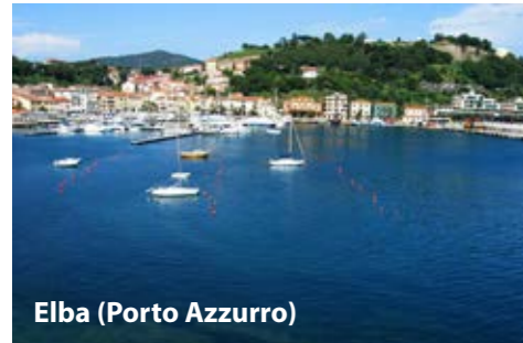
Elba (Porto Azzurro)