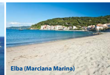
Elba (Marciana Marina)